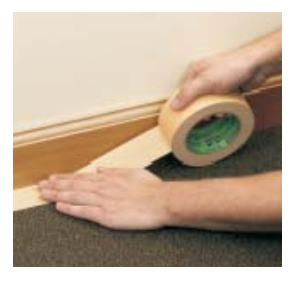
Masking baseboard to protect floor