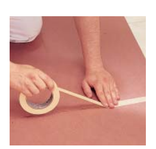
Taping paper to protect floors