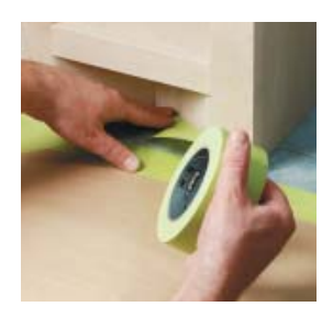
Masking surfaces for lacquer coating application