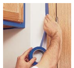
Masking enameled or varnished woodwork