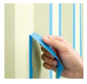
For super-sharp paint lines on freshly painted surfaces (1 day old)