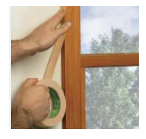
Masking window trim